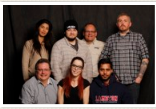
Our Lambton College Photographers