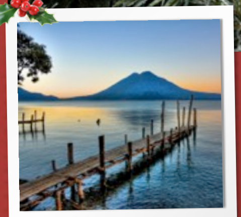
GUATEMALA PHOTO TOUR JANUARY 15TH TO 21ST, 2016