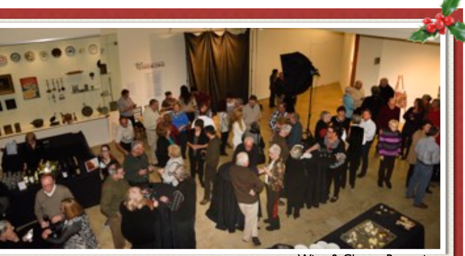
Wine & Cheese Reception