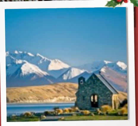
NEW ZEALAND PHOTO TOUR MARCH 20TH TO APRIL 6TH, 2016

" Combining the Art of Photography and Adventure Travel "