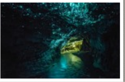
Glow Worm Caves