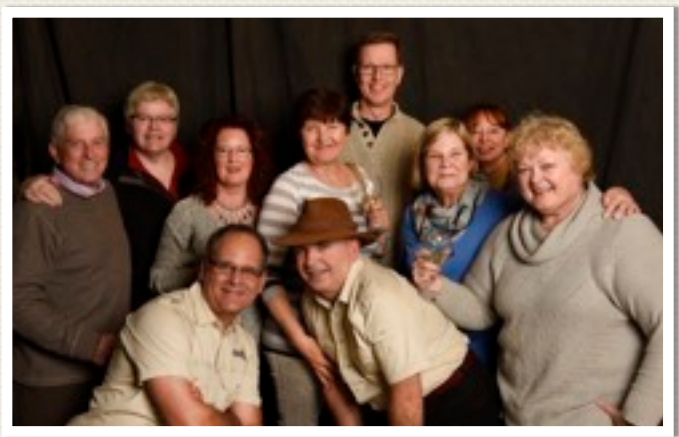
Some of the Trekkers that went on our Scotland Tour