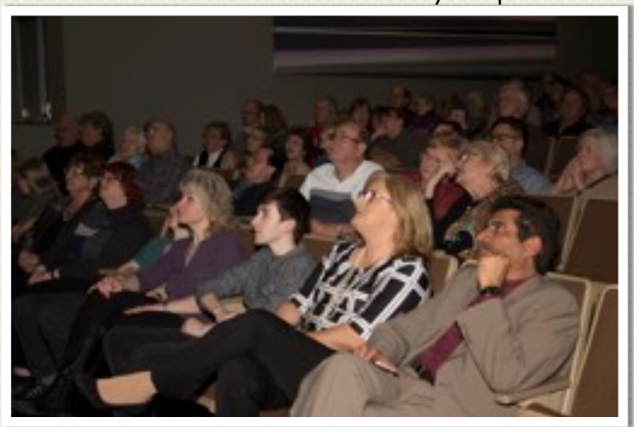
Guests enjoying the presentation