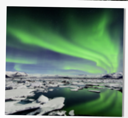
ICELAND NORTHERN LIGHTS MARCH 2ND TO 7TH, 2016