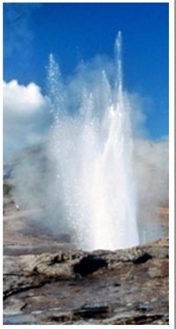
Iceland, June 2012 Tour

New York City Photo Tour May 17th - 21st 2012