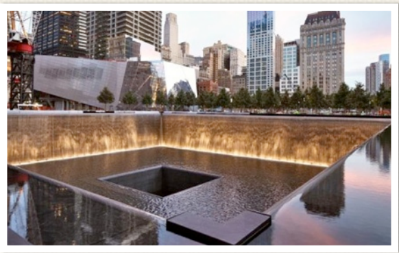
To register for our NYC Photo Tour visit our website at <a href="https://www.PhotoTourTrekkers.com">www.PhotoTourTrekkers.com</a> space is still available.