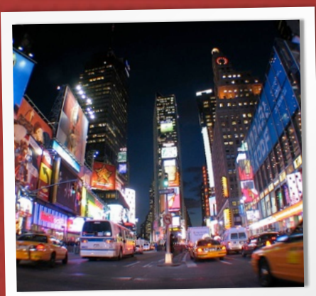
NEW YORK CITY PHOTO TOUR MAY 17TH TO MAY 21ST, 2012

During our visit we will be staying at the Salisbury Hotel, offering easy access to Central Park, Time Square,