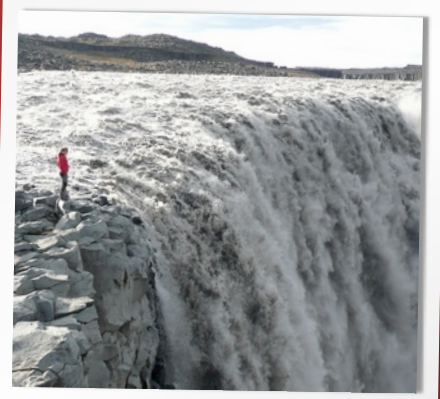
ICELAND PHOTO TOUR JUNE 15TH TO 23RD, 2012