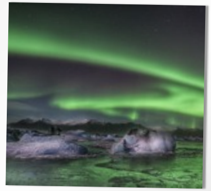
ICELAND NORTHERN LIGHTS END OF FEBRUARY 2015