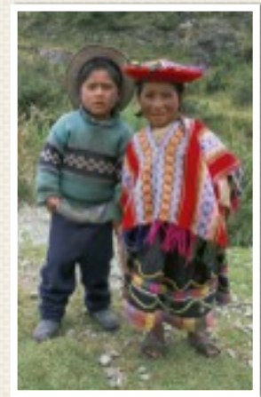
Machu Picchu Photo Tour November 3rd to 10th, 2014

Impressions Newsletter ... "Photographing the Lost City"