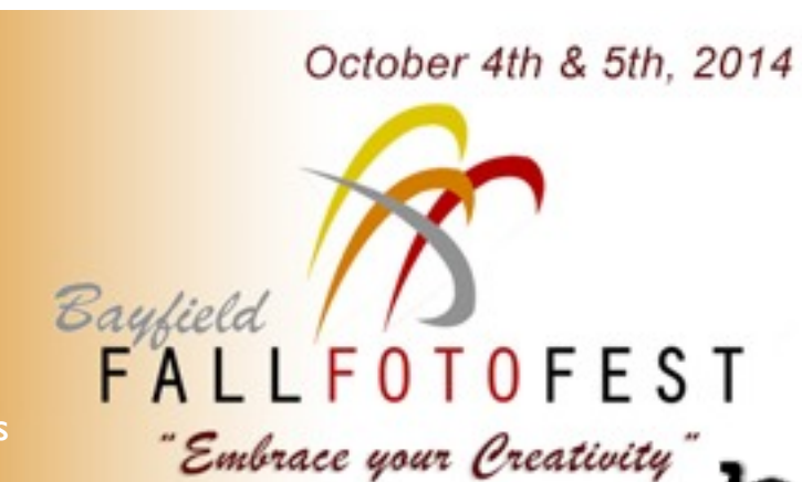
Photo Tour Trekkers is pleased to be partnering with the Photography Club of Bayfield for the second annual Bayfield Foto Fest, Saturday October 4th and Sunday October 5th, 2014.

Over the two days of Fall Foto Fest participants will have the opportunity to attend two photo keynote presentations and choose from 6 workshops. Come for the day or come for the weekend. We have created a workshop schedule that allows you take two of our six workshops in one day or four of our six workshops over two days and a different keynote presenter of Foto Fest.