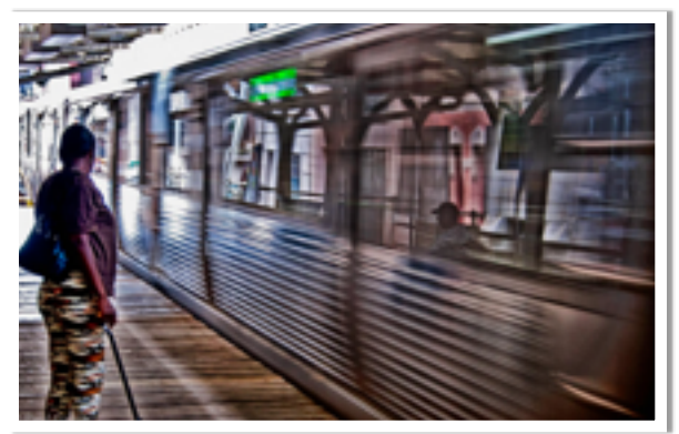
Chicago Weekend image by Paul Garner

Follow us on Twitter: <a href="https://twitter.com/PhotoTrekkers1">https://twitter.com/PhotoTrekkers1</a>