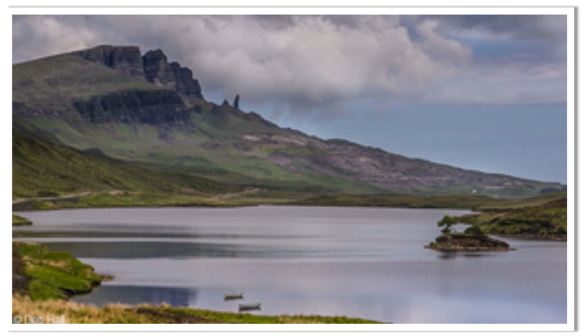
Outer Hebrides Scotland