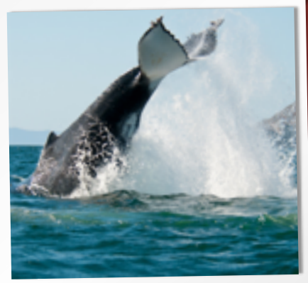
GALAPAGOS ISLANDS PHOTO TOUR JUNE 7TH TO 17TH, 2015