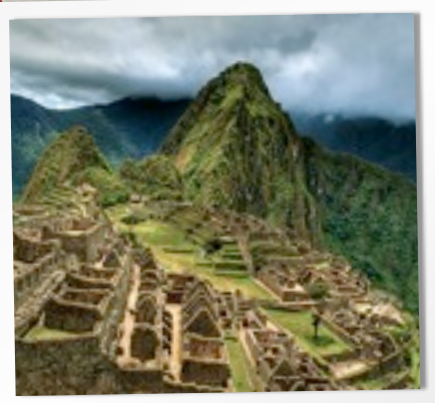
MACHU PICCHU PHOTO TOUR NOVEMBER 3RD TO 10TH, 2014

Join us November 3rd to the 10th as we photograph and explore the Lost City. During our tour we will also be spending time in Lima, Cusco, and the Sacred Valley. We will be taking