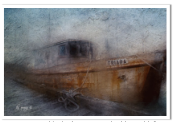
Haida Gwaii